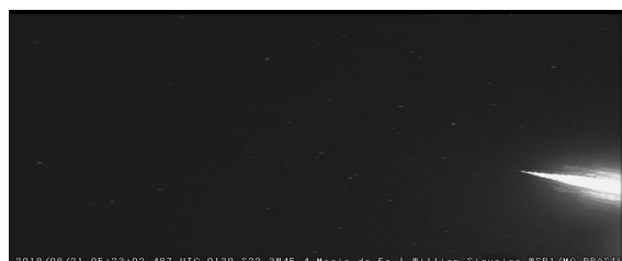
FIGURE 1. Meteor registered by station WSR1.