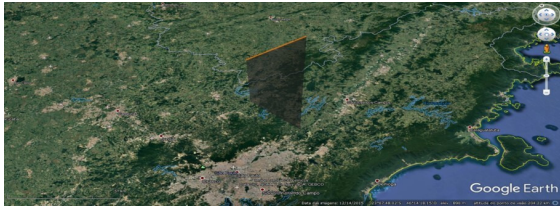
FIGURE 2. Meteor of trajectory.

38.7° and Declination: -58.8°. Being the Right Ascension and Declination related to the moment when the meteor hits Earth. As shown in 2.