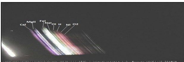
FIGURE 4. Meteor Spectrum Analyzed.

From the recorded spectrum with 66 frames, it was possible to analyze frame by frame and observe how the meteor spectrum behaves. Represented in 4 below.